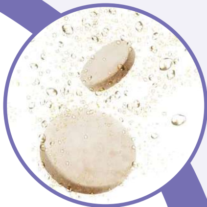
24 Green Tablet 15 Tablet